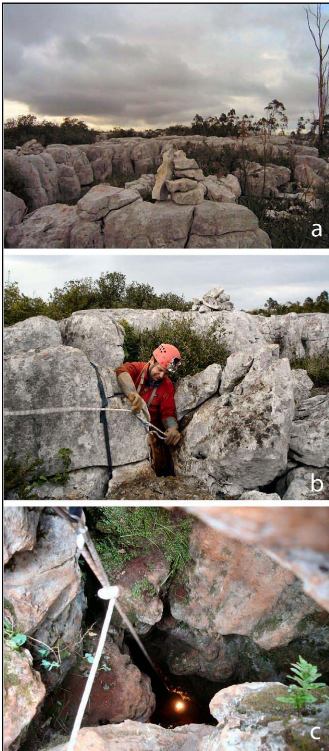
Fig. 2. Location (a, b) and the character (c) of the cave entrance.